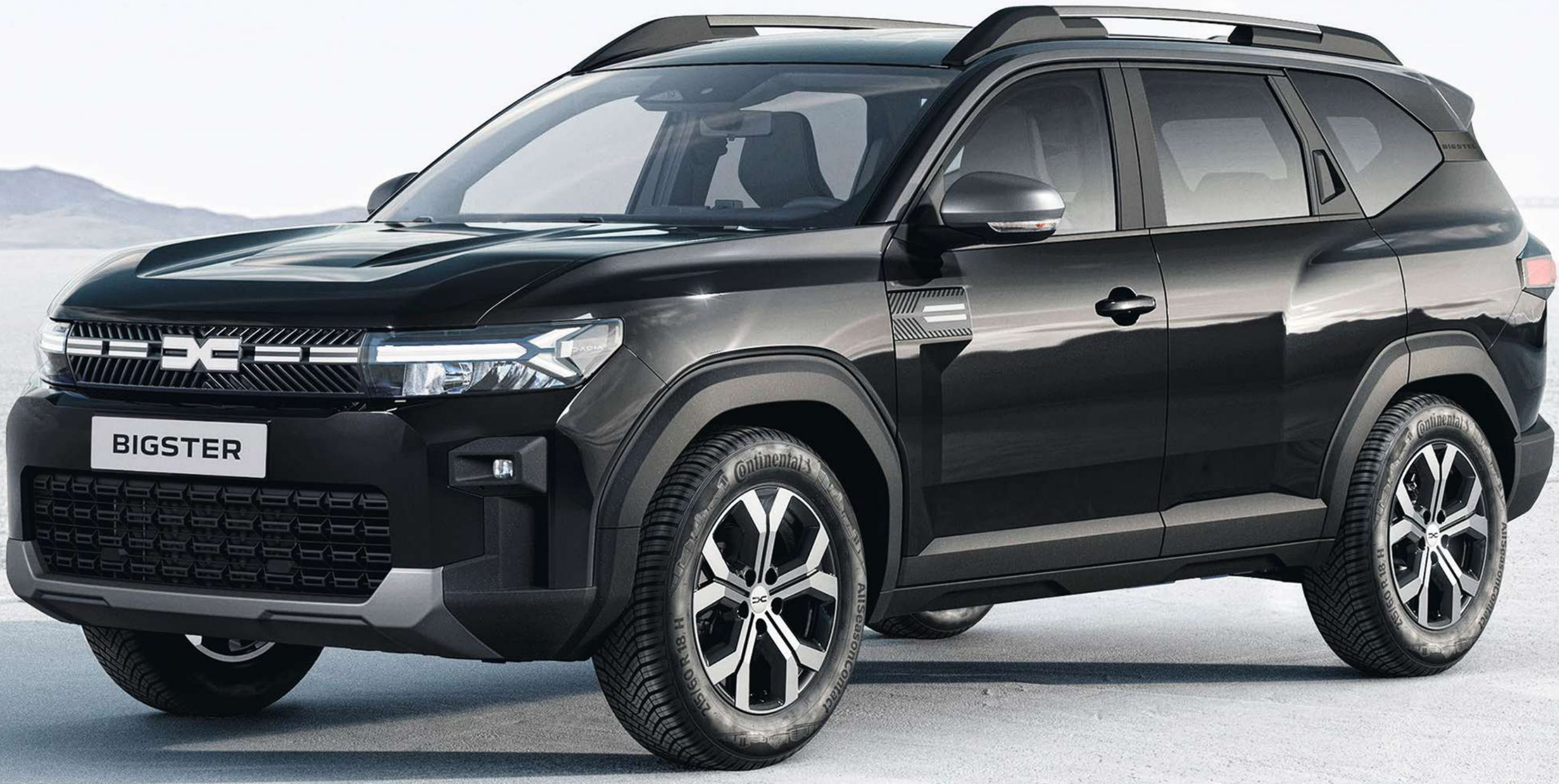
PEARL BLACK (2)