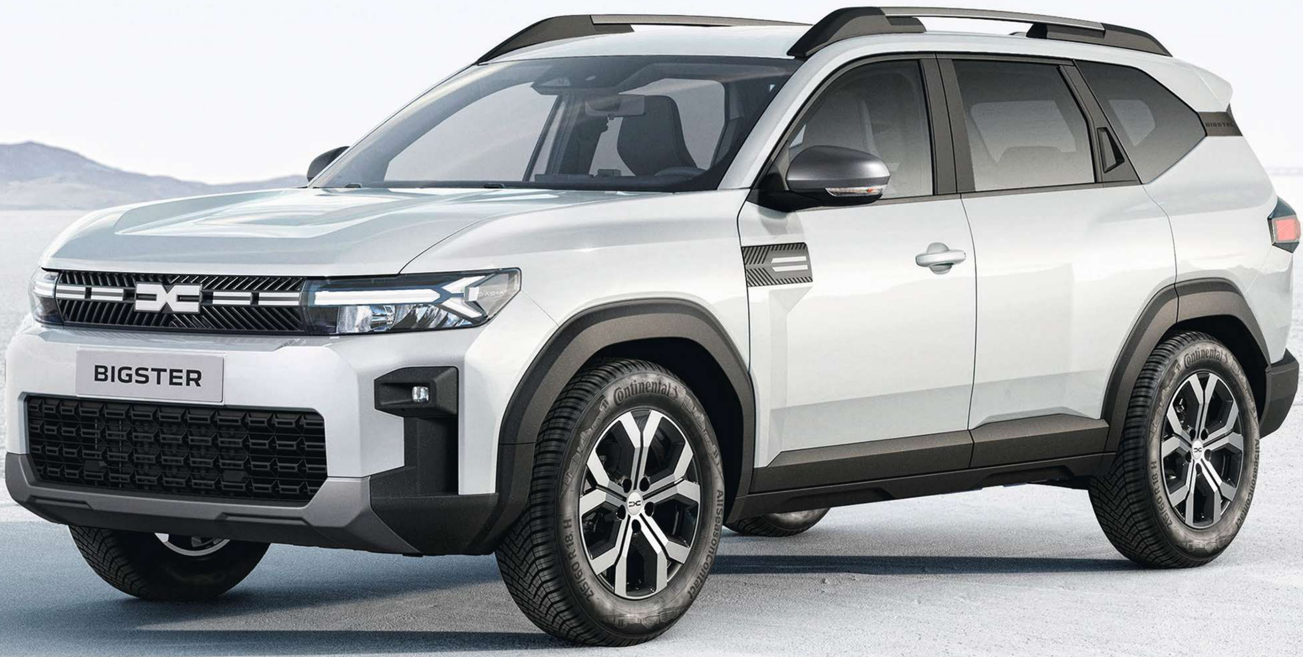
GLACIER WHITE (1)