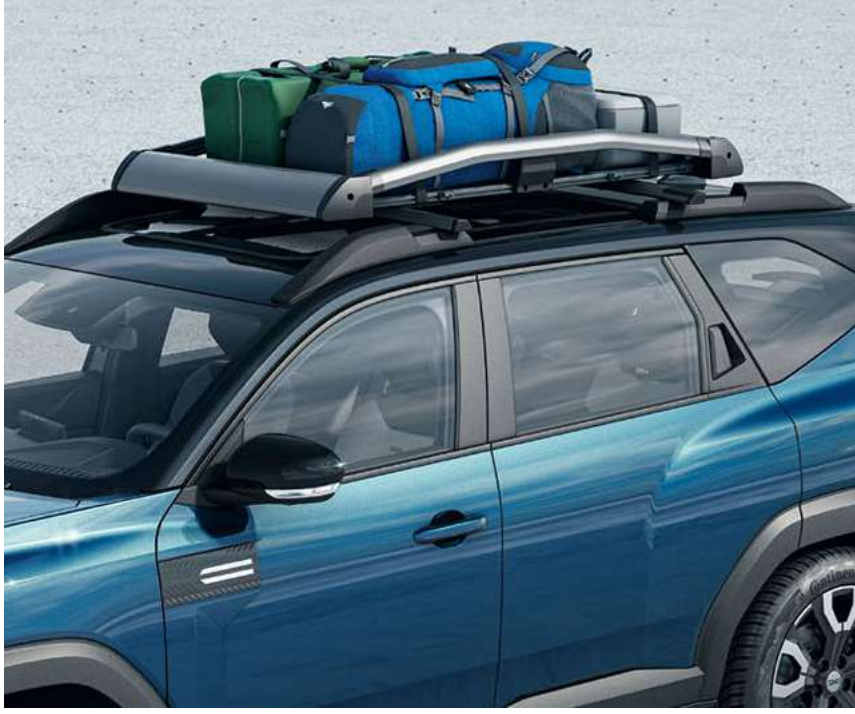
Cargo roof rack