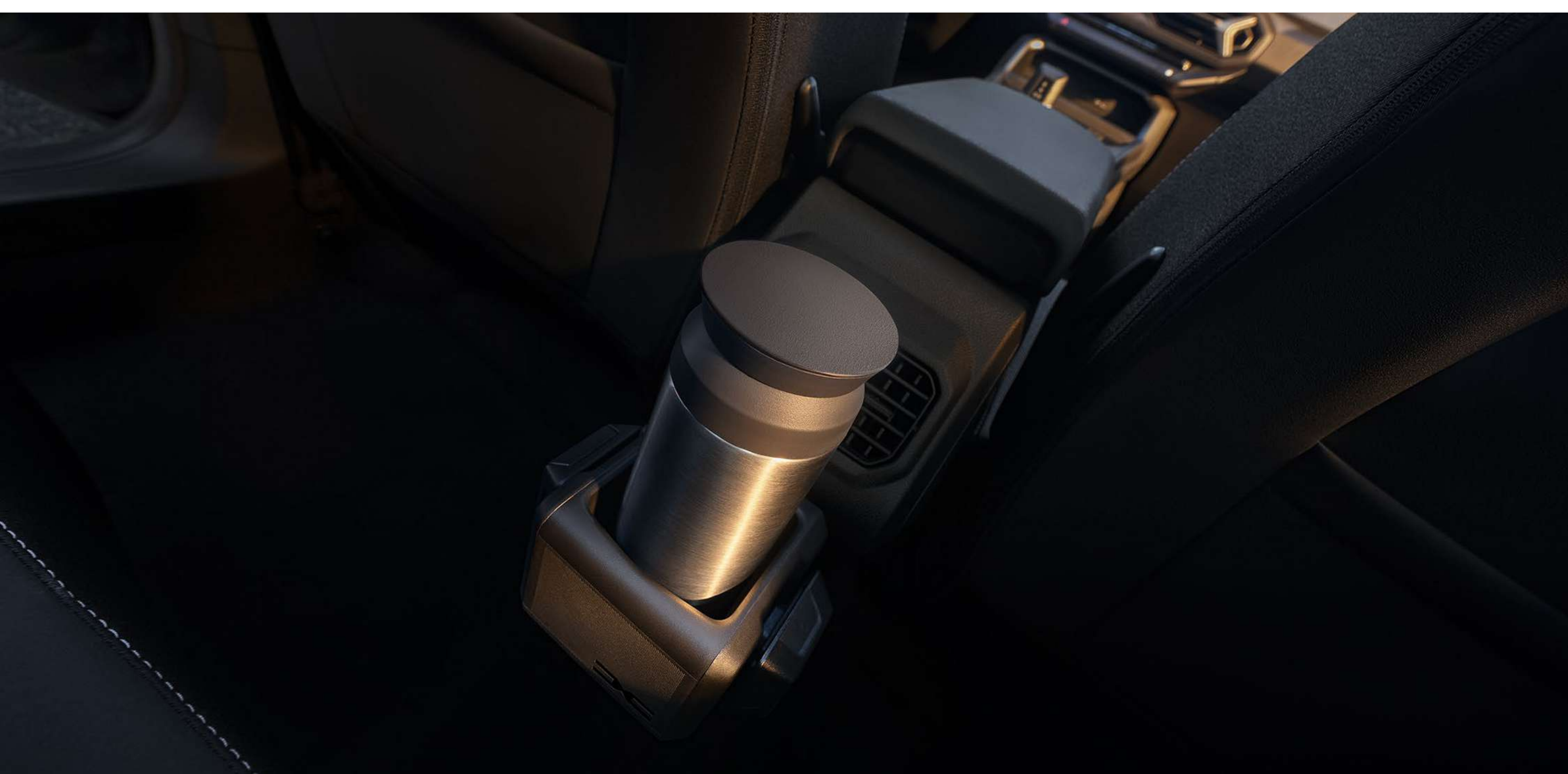
3-in-1 YouClip (2)