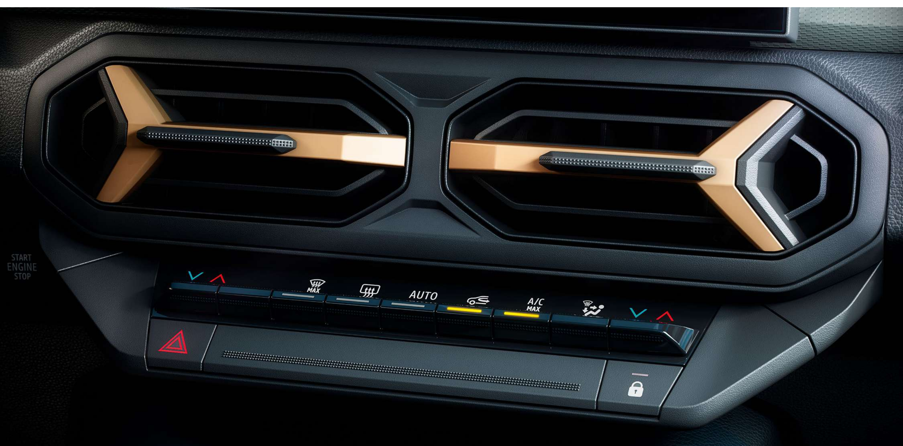
Dual Zone automatic air conditioning

Designed for the pleasure of five passengers, the interior ambience features controlled soundproofing, an Arkamys® 3D sound system with six speakers and customisable dual-zone air conditioning in the front and with the rear air vents.