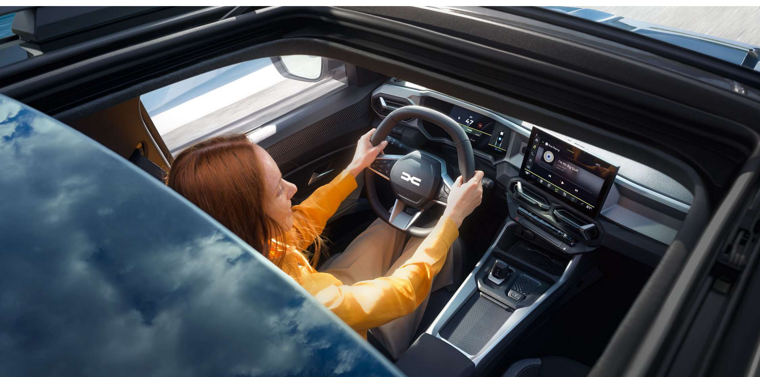
Panoramic opening sunroof (2)

Featuring a panoramic opening sunroof (1) providing unique interior light, its exclusive Indigo Blue exterior colour adds an additional touch of distinction. There's a Bigster for everyone.