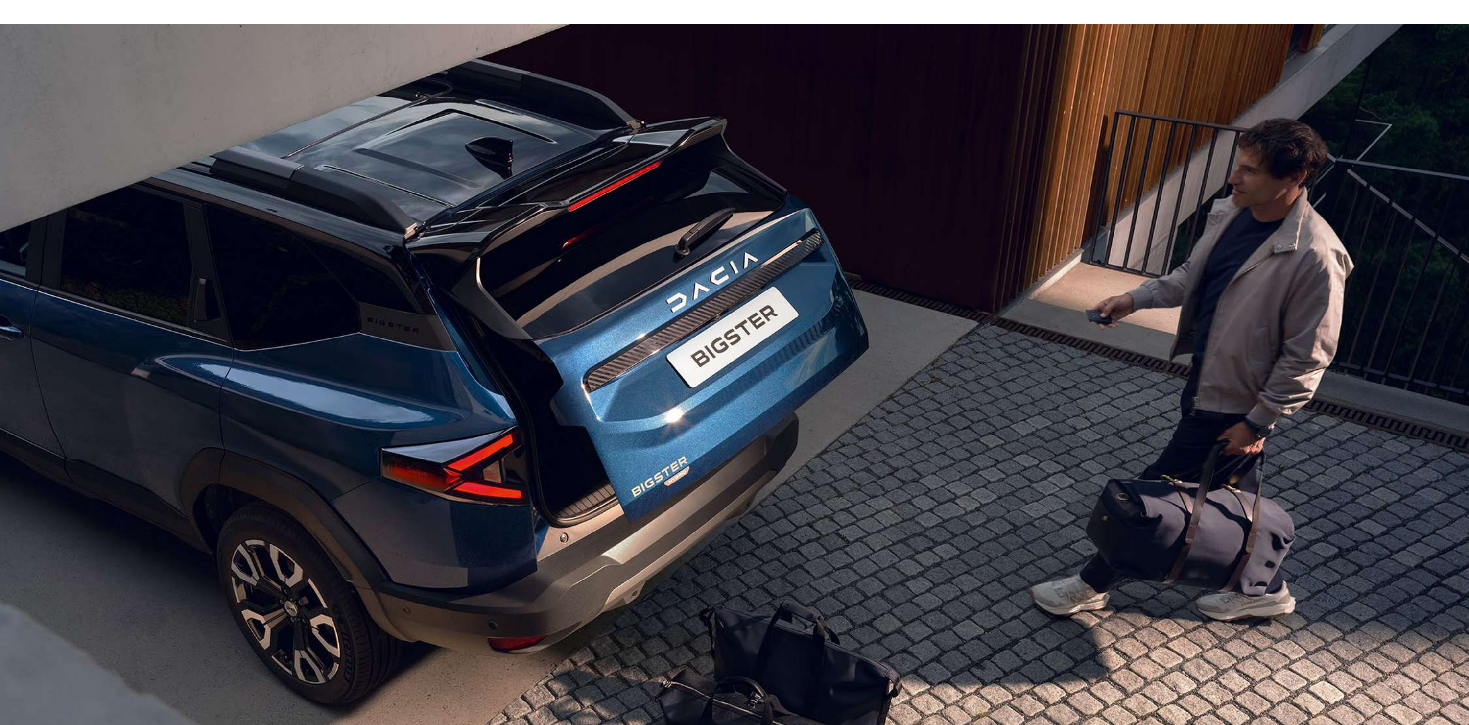
Powered tailgate (3)