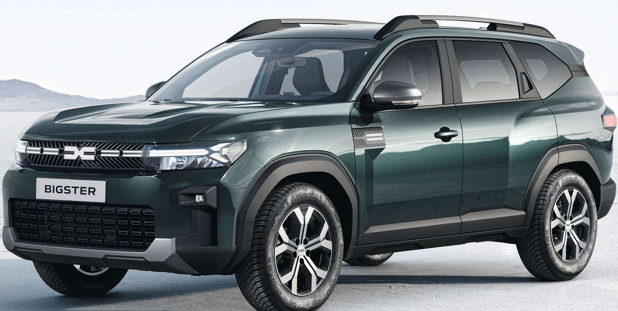
CEDAR GREEN (2)