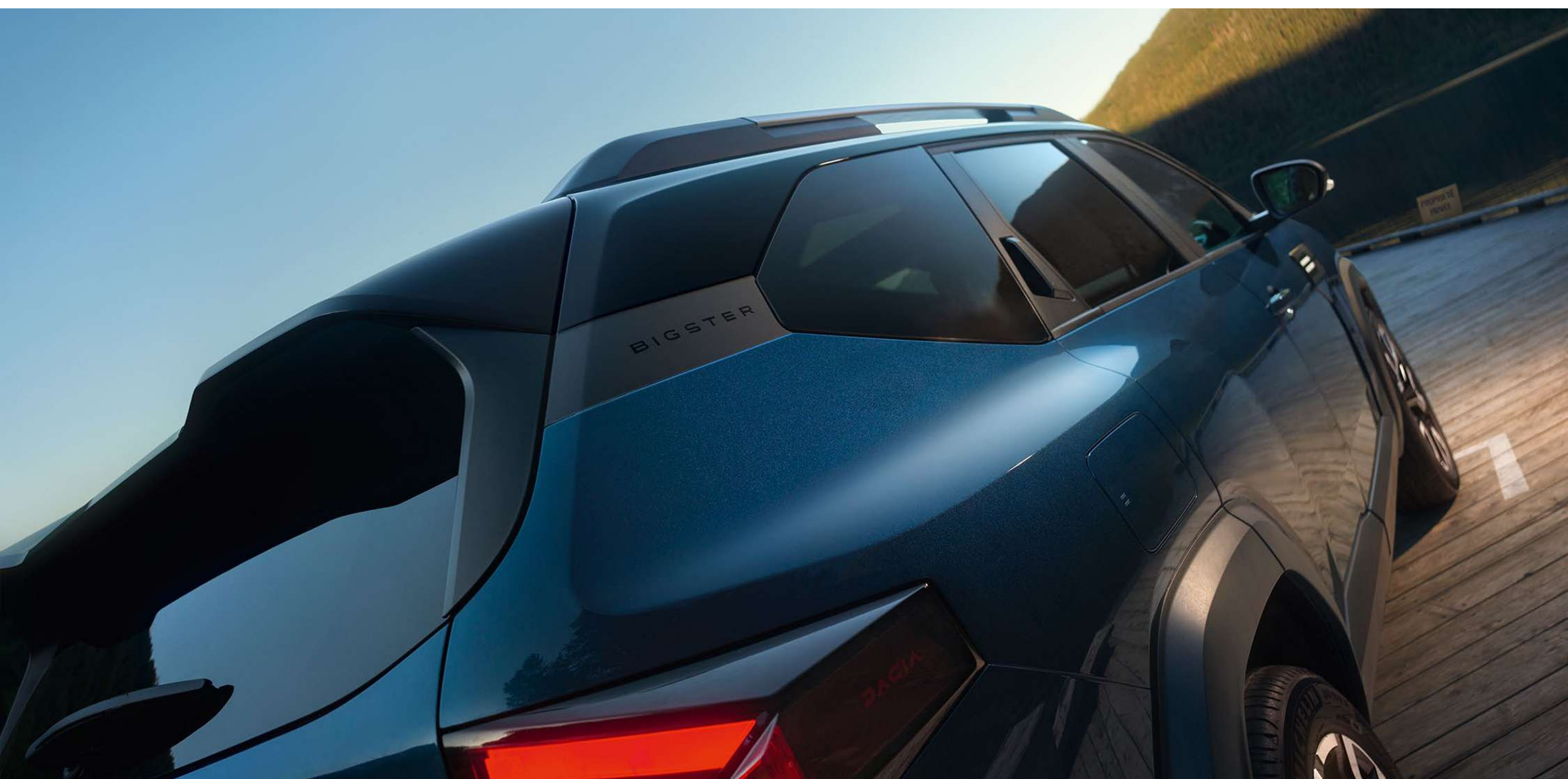
Exclusive two-tone colour (3)