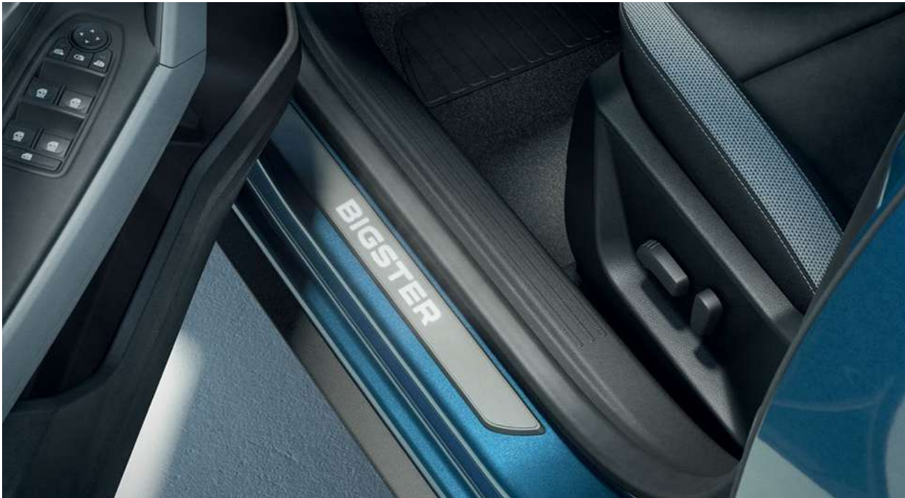
Illuminated door sills