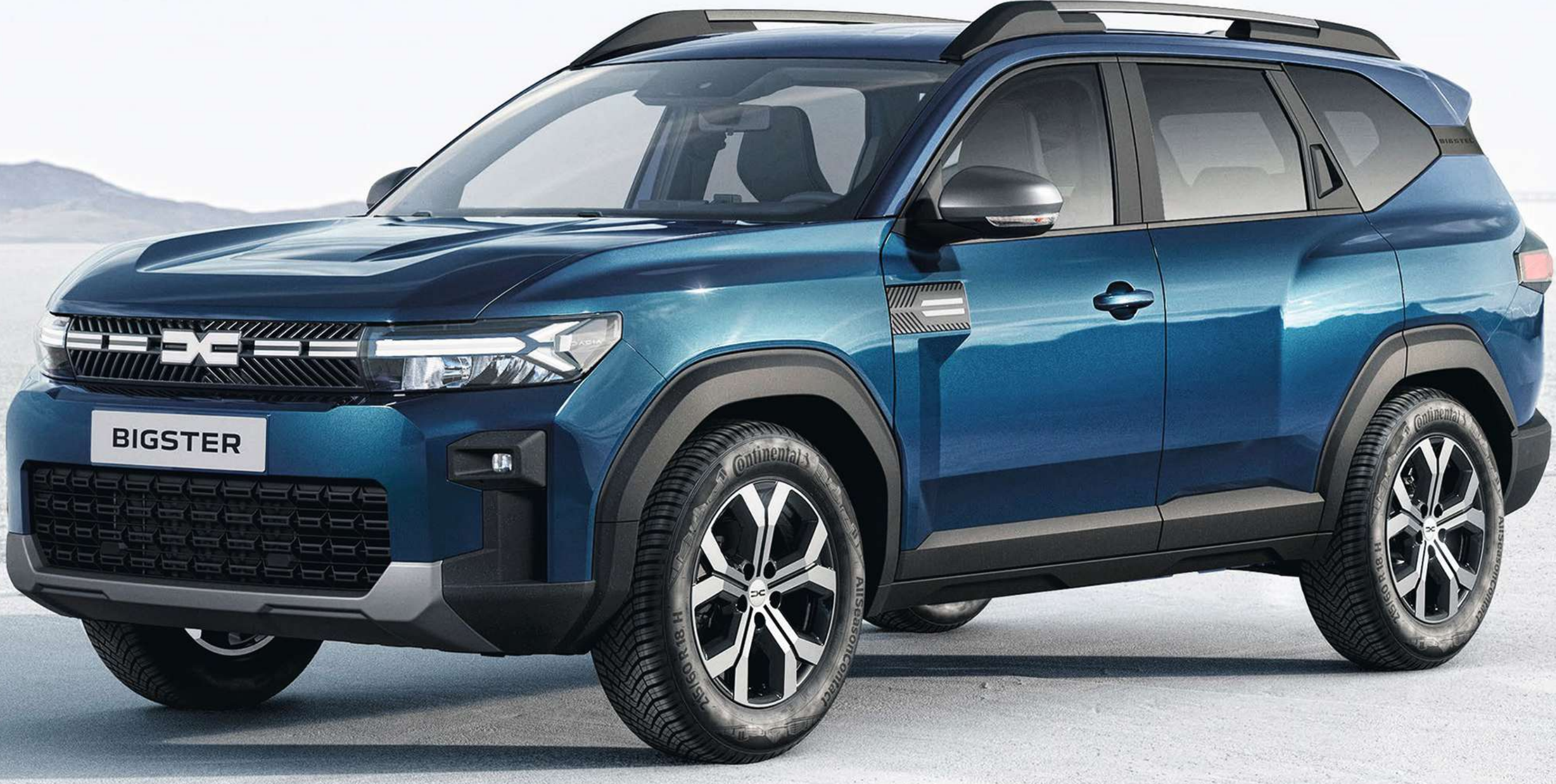
INDIGO BLUE (2)(3)