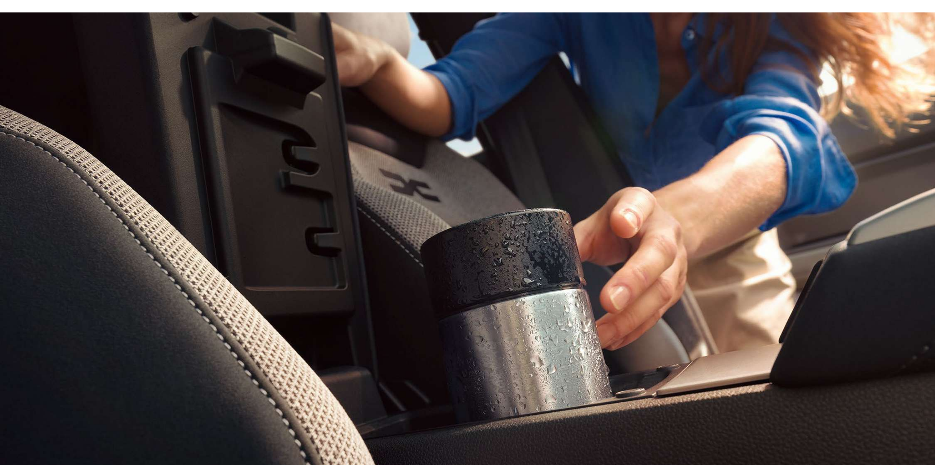
High console with cooling storage (1)

And try out the ingenious YouClip attachment system: four fixation points distributed throughout the vehicle, with the option to add two additional points with the headrest support as an accessory. Use it to securely hang all your various items (phone, tablet, cup, etc.).