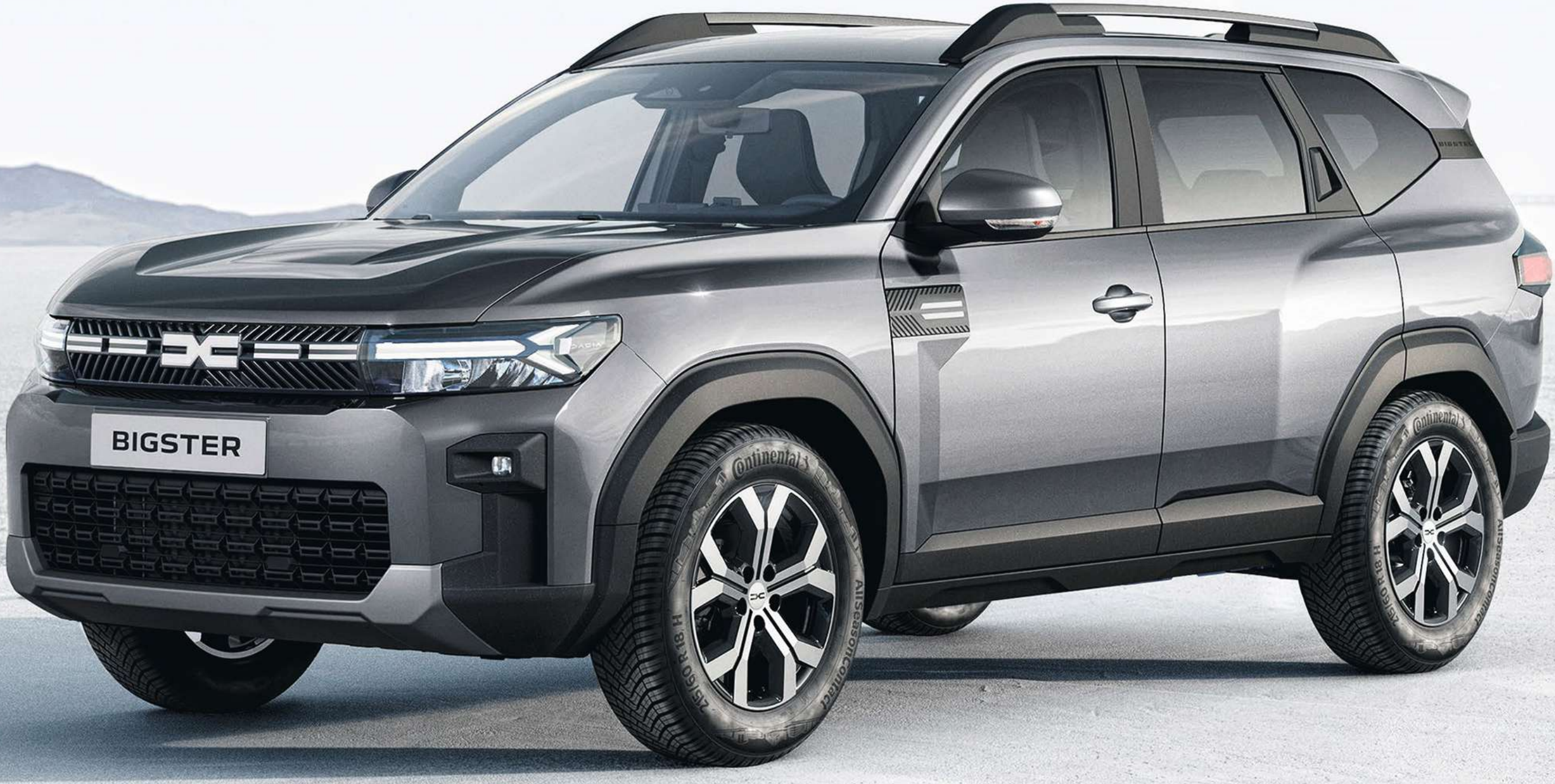
SHADOW GREY (2)(3)